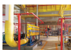
Manufacturing Equipment/ Chemicals